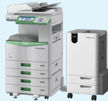
e-STUDIO306LP e-STUDIO RD30

The Paper Reusing System consists of the e-STUDIO306LP which prints documents in erasable blue toner, and the e-STUDIO RD30 which erases the documents, so each sheet of paper can be used 5 times or more.