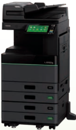
"Loops" paper reusing system

Semi-self-checkout system with which shoppers perform the payment by themselves