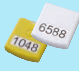
Sensing solutions (Beacon terminal)